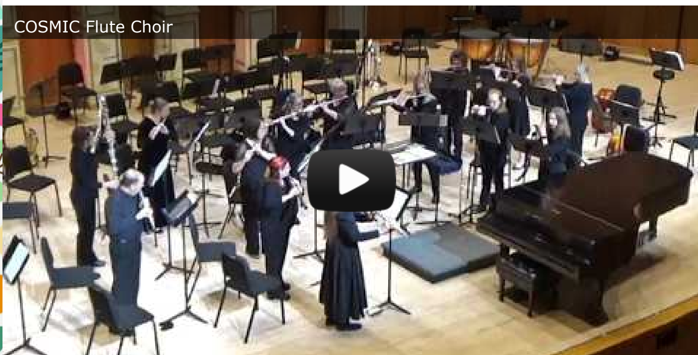
COSMIC Flute Choir